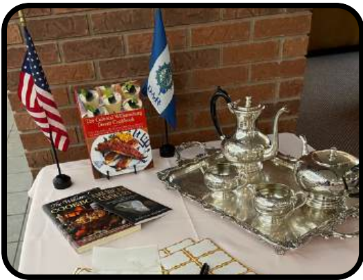
The Cahokia Mound Chapter organized a colonial potluck based on recipes from Colonial Williamsburg Cookbooks.