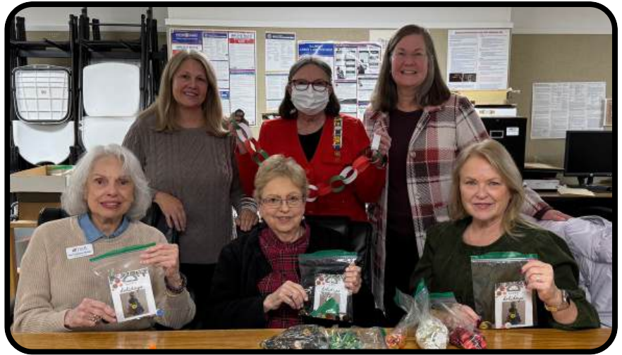
The Edwardsville Chapter filled craft bags for Santa to hand out at the Yanda Log Cabin in Glen Carbon.