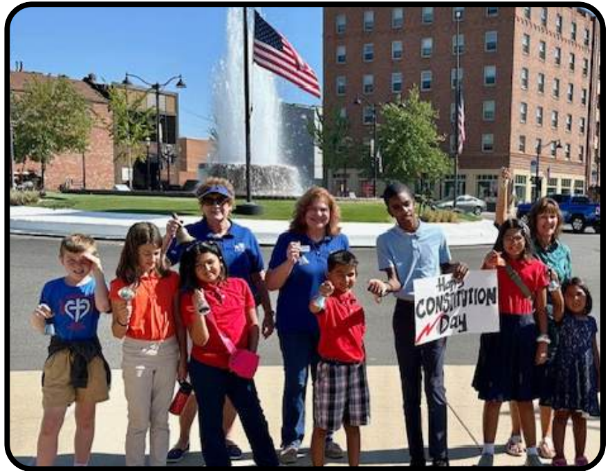
The Belleville Chapter, accompanied by students from the Legacy Christian Academy, rang bells to celebrate Constitution Day.